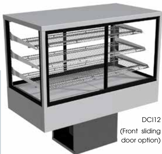
DCI12 (Front sliding door option)