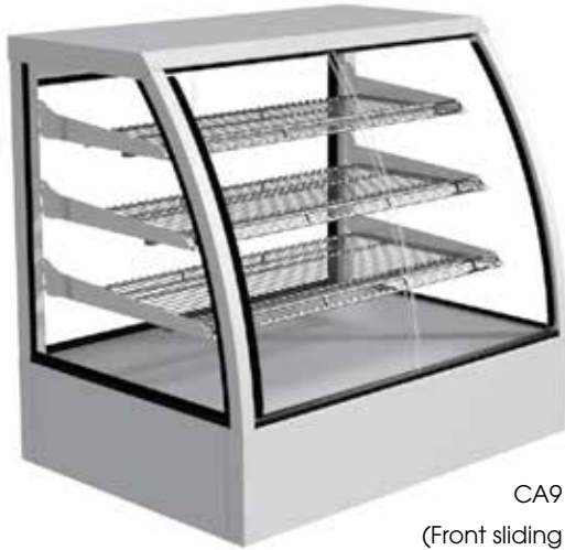
CA9 (Front sliding door option)